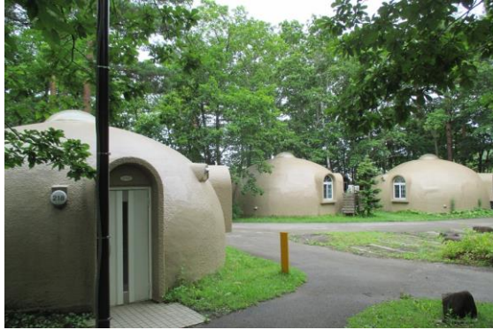
(Dome style cottage)